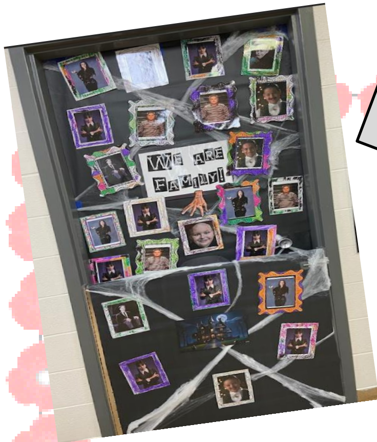
Pre-K – Grade 1 Congratulations Pre-K Class!