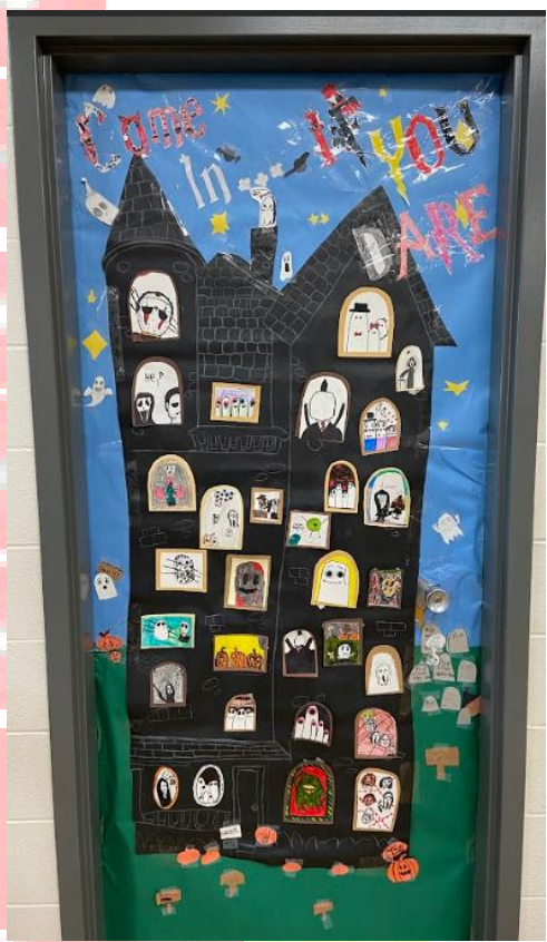
Grades 2 - 5 Congratulations Grade 4 Class!