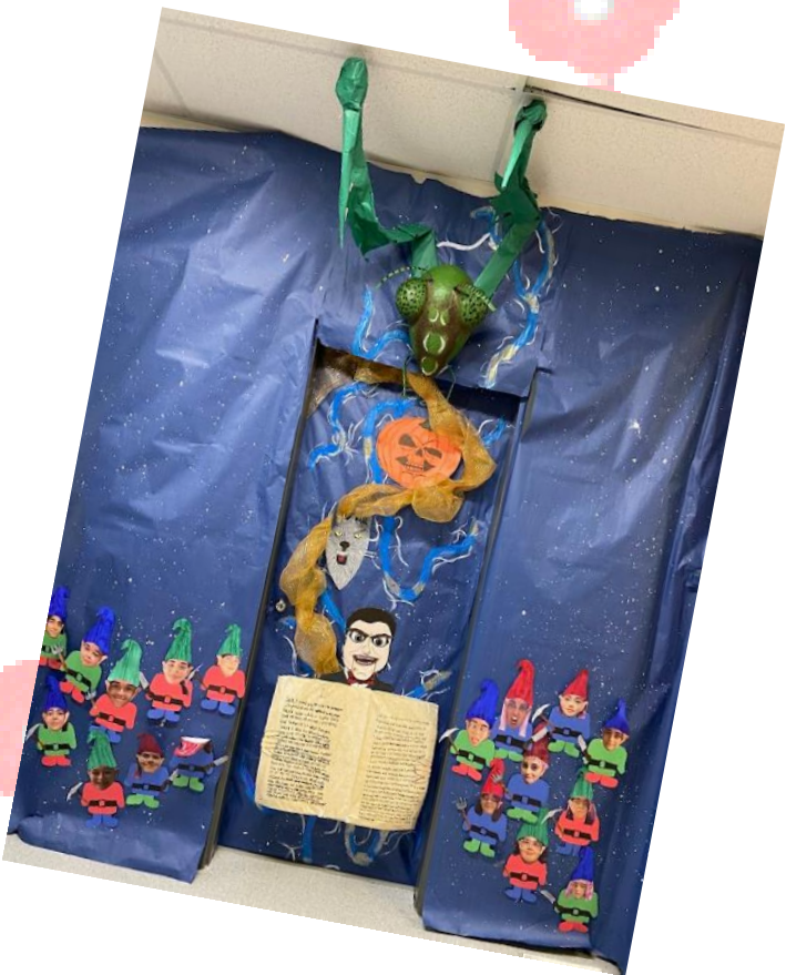
Grade 6 – 8 Congratulations Grade 8 Class!