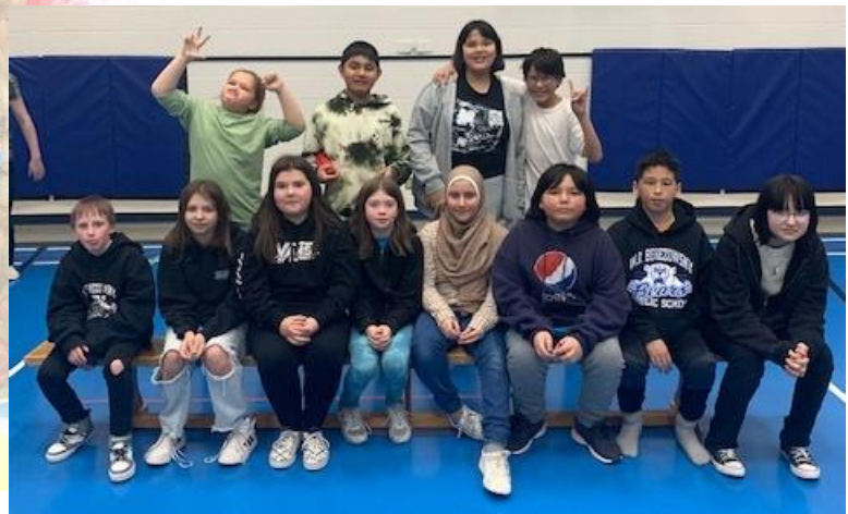
Top Classroom sales: Grade 6 class